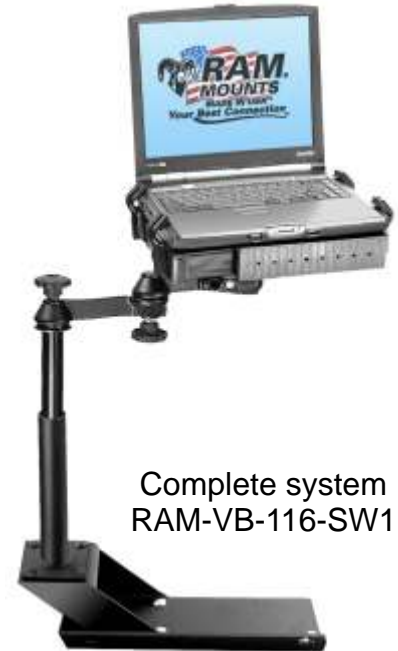
Complete system RAM-VB-116-SW1

National Products, Inc. Phone: 206-763-8361 Fax: 206-763-9615 Address: 8410 Dallas Ave S Seattle, WA 98108 Website: www.ram-mount.com Email: staff@ram-mount.com