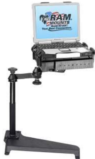
Shown In Use