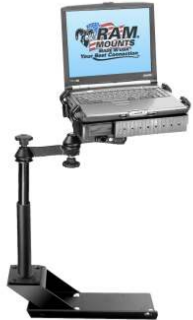
Shown In Use

The RAM-VB-116 base will not fit crew cab vehicles where the vent duct passes under the front of the passenger seat.