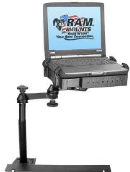
Shown In Use

National Products, Inc. Phone: 206-763-8361 Fax: 206-763-9615 Address: 1205 S Orr St Seattle, WA 98108 Website: www.ram-mount.com Email: staff@ram-mount.com