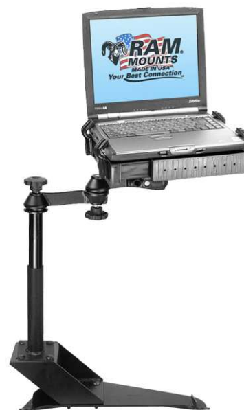
Shown In Use