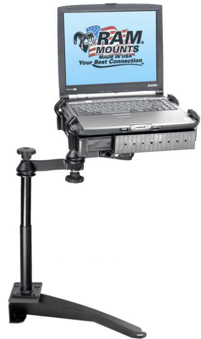
Shown In Use