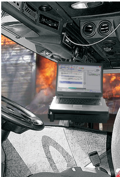
In Vehicle Facing Driver