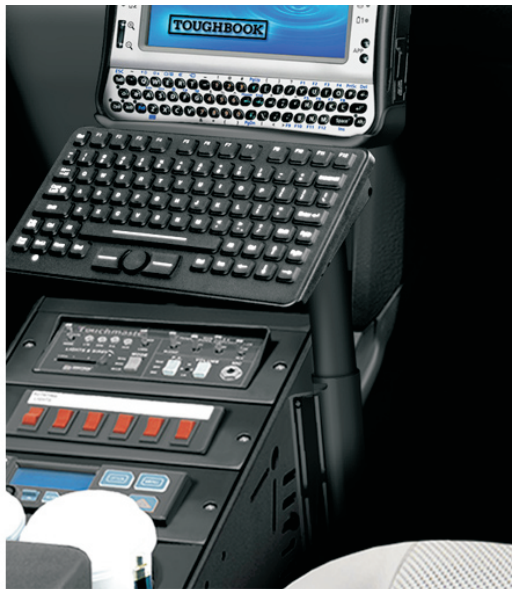
On RAM Console Box