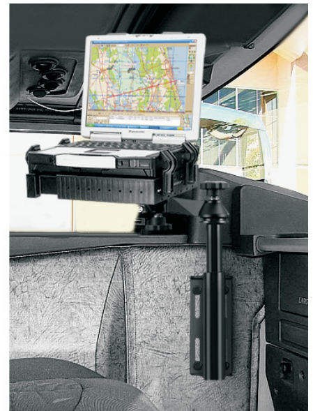
In Vehicle Facing Passenger

National Products, Inc. Phone: 206-763-8361 Fax: 206-763-9615 Address: 1205 S Orr St Seattle, WA 98108 Website: www.ram-mount.com Email: staff@ram-mount.com