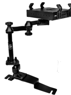
Complete Vehicle Mount RAM-VB-190-SW1