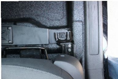
Installation photo of 2013 FPI Sedan. Under seat leg installation.